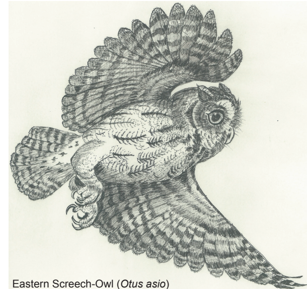
Eastern Screech-Owl ( Otus asio )